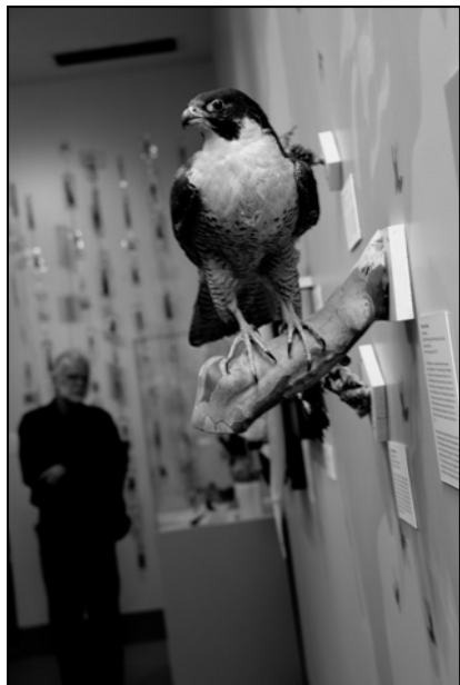
Peregrine Falcon on display in Flocks & Feathers .