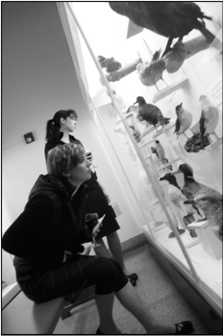
Guests get closer to the birds in the Everhart's permanent bird gallery.