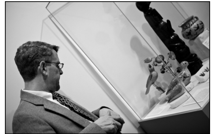
A guest views cultural objects on display in Flocks & Feathers .